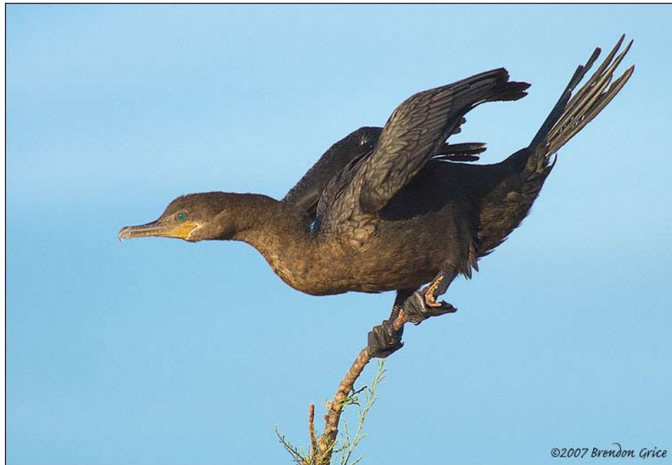
Figure 1. Adult Neotropic Cormorant, Gilbert, AZ.

The Neotropic Cormorant ( Phalacrocorax brasilianus ) is suitably named given it is the only cormorant ranging over the entire neotropics. Although it is widespread throughout most of the western hemisphere, in the U.S. it is found primarily along the Gulf States of Texas and Louisiana, north locally to Kansas, and in south-central New Mexico. The species is sedentary throughout most of their breeding range, with widespread post breeding dispersal (figure 1).