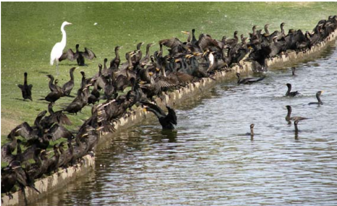
Figure 3. Congregation of about 100 cormorants, mostly Neotropic with several Double-crested Cormorants at Kokopelli Golf Course in Gilbert, AZ.

In Arizona, Neotropic Cormorants prefer fresh water lakes, ponds, lagoons, and slow moving rivers containing large densities of fish with available trees, snags, islands, or open banks for loafing. In Maricopa County the species has become common to locally abundant in some urban lakes and ponds in the greater Phoenix area, as well as along perennial sections of the lower Salt and Gila rivers downstream to Gillespie Dam. Several concentration areas have already exceeded 500 individuals (figure 3). The highest densities have been observed at several residential lakes in Chandler and Gilbert, just upstream of Tempe Town Lake, and several gravel extraction company lakes on the Salt and Gila Rivers. However, it should be noted that the specific concentration locations are often temporary and are based on abundant populations of appropriate size fish. Once prey populations are reduced, these highly mobile cormorants readily move to other neighborhood lakes and ponds.