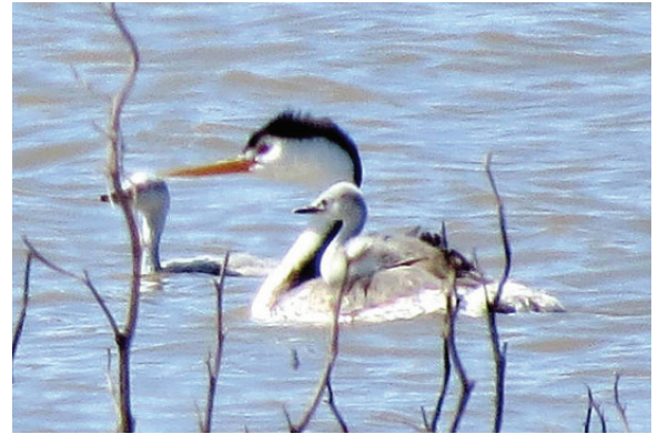
Figure 6. Clark's Grebe with downy young. 9 May 2015.

Surveys conducted from 1993 to 2001 for the Arizona Breeding Bird Atlas detected grebes at the lake, but found no evidence of breeding (Corman and Wise-Gervais 2005). Survey teams and other birders may have visited the lake when nesting wasn't occurring, as breeding has been confirmed numerous times in the past dozen years. The first report was of two family groups of Western Grebe and two of Clark's Grebe on the south side of the lake 3 July 2005. Since then, downy young, including some on the backs of adults, have been reported between May and August in some years (Figure 6). Most noteworthy was the discovery of an estimated 100 nests of Aechmophorus grebes in shallow water among flooded tamarisk clumps 16 July 2015. At least 10 of the nests were positively identified as Clark's, although there were likely more. No young were observed, but adults were sitting on some nests, and active nest building was observed, with grebes carrying sticks to nests.