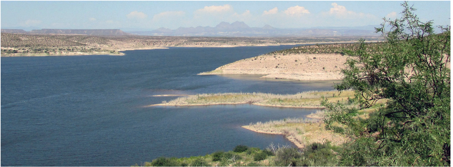
Figure 2. San Carlos Lake looking east from south side. 20 August 2017.

In addition to the Gila River, the San Carlos River empties into the lake from the north. The Apache town of San Carlos was located on the flats near the mouth of the San Carlos until the area was flooded by the lake. The town was relocated about a dozen miles to the north; with more than 4,000 residents, this is now the Nation's largest town (Wikipedia 2017). When the water recedes, the ruins of stone buildings are a reminder of the town that once was there. On the bluff overlooking Old San Carlos, a memorial honors Geronimo and the Apache people. According to an inscription at the site, the two statues were completed in 2009 with funds raised from Apaches throughout the United States.