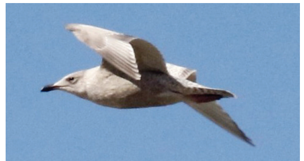
Figure 4. Iceland (Thayer's) Gull. 8 Nov 2017.

According to the Arizona Game and Fish Department, there are several Bald Eagle nests in the general vicinity of the lake (pers. comm. J. McCarty), and eagles are seen foraging on most visits year-round (Figure 5). Wintering and migrant Ospreys are expected from fall through spring, but have also been observed in midsummer. In some years, Great Blue Heron and cormorant rookeries have been reported near the lake. For most of the 2000s, Double-crested Cormorants were by far more numerous, but in the last five or six years, reports and numbers of Neotropical Cormorants have increased, corresponding to the general trend in the state. They have been observed nesting alongside Double-crested Cormorants in rookeries at the mouth of the San Carlos River. Double-crested Cormorants have nested at the lake since at least the 1960s (Monson and Phillips 1981).