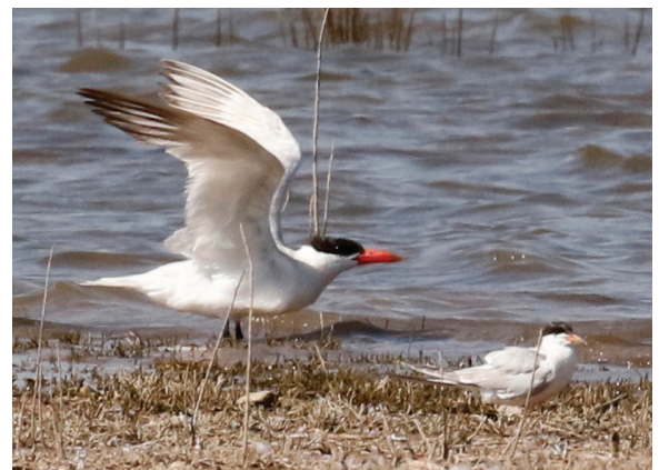
Figure 7. Caspian Tern (l) and Common Tern (r). 30 August 2017.

Six species of terns and seven of gulls have also been reported from San Carlos Lake (Figure 7). The Arctic Tern in 2010 was only the sixth record for the state. High numbers of 15 Caspian Terns, 7 California Gulls, and 150 Ring-billed Gulls have been reported, and it is often a good place to view migrant Franklin's and Bonaparte's gulls during the proper season. The lake can also be an excellent place to view shorebirds, though viewing conditions vary greatly with the water level. Lower levels result in sandy spits, islands, and more rarely extensive mudflats, which attract a wide variety of shorebirds and waders. In addition to those previously mentioned, the list of "rare-but-regular" shorebirds observed includes both Sanderling and Black-bellied Plover. Conditions can be good during spring migration, but the best shorebirding is usually encountered from August to November.