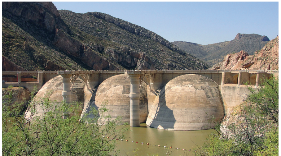
Figure 1. Coolidge Dam. 16 July 2015.

San Carlos Lake was created in 1930 when the Coolidge Dam was completed on the Gila River in the San Carlos Apache Nation (Figure 1). When full, the lake stretches 23 mi, with a maximum width of two miles and a maximum surface area of 19,500 acres, making it most of the time one of the largest lakes in the state (Figure 2). Because of drought and irrigation demands from farmers in the Coolidge and Florence areas, the water level drops low enough in some years to kill the lake's fish. Since the dam was completed 87 years