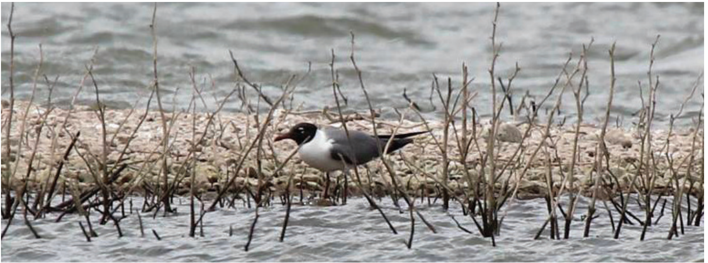
Figure 3. Adult Laughing Gull. 15 May 2015.

Laughing Gull has been documented three times, twice in the spring (Pinal County 30 April 2004 and 15 May 2015) and once in the fall (Pinal and Graham counties 10 November 2013) (Figure 3).